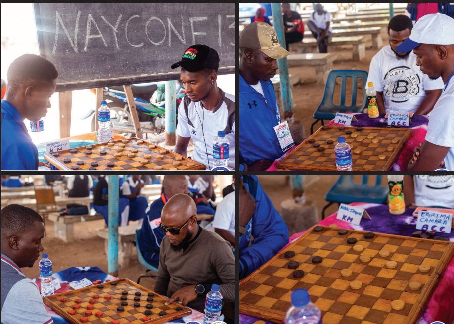
Below are the final results of the NAYCONF draught championship